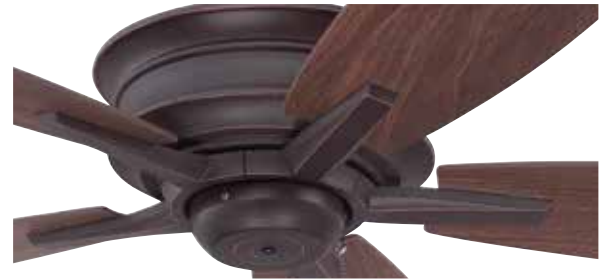
Shown with Reversible Walnut Blades and No Light Kit