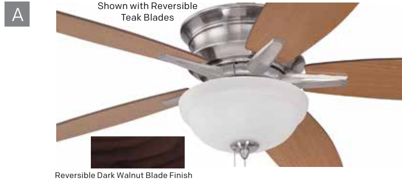
Reversible Dark Walnut Blade Finish