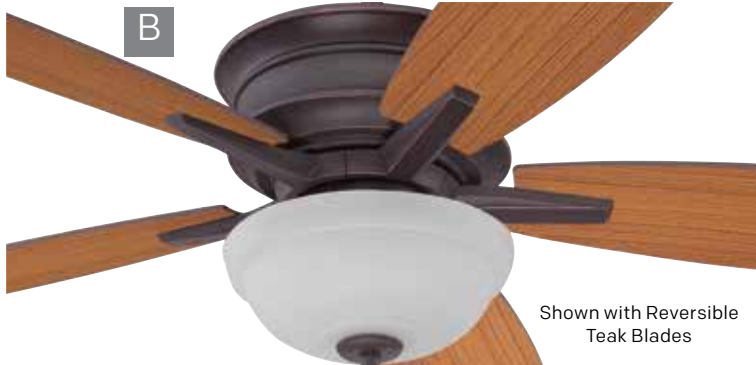
Shown with Reversible Teak Blades