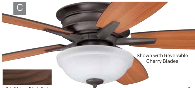
Shown with Reversible Cherry Blades