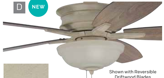
Shown with Reversible Driftwood Blades