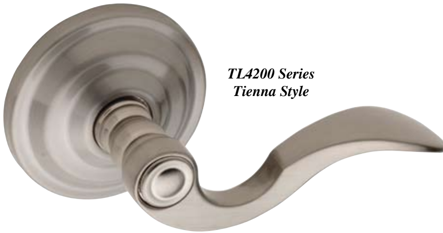
TL4200 Series Tienna Style