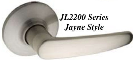
JL2200 Series Jayne Style