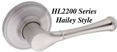
HL2200 Series Hailey Style