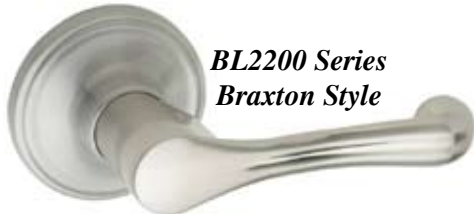
BL2200 Series Braxton Style