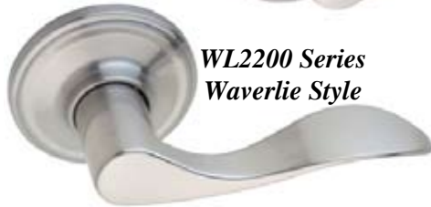
WL2200 Series Waverlie Style