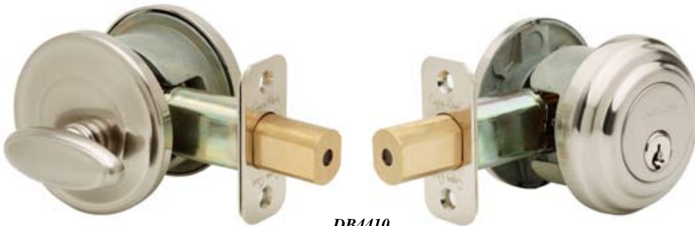
DB4410 Single Cylinder Deadbolt