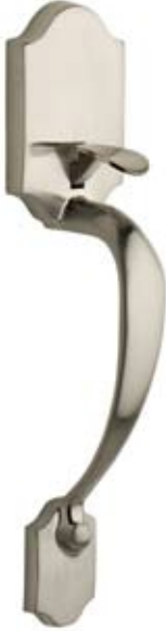
CH2610 Colonial Style 2-Piece Handleset