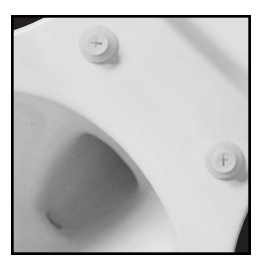
EASY•CLEAN™ LIFTS OFF FOR EASY CLEANING

Phone: 920-467-2664 800-233-7328 Fax: 920-467-8573