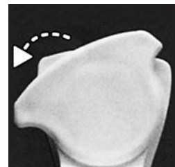
TWIST HINGE TO UNLOCK