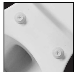
EASY•CLEAN™ LIFTS OFF FOR EASY CLEANING