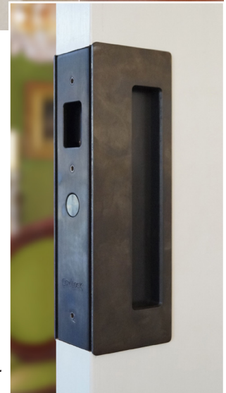
3 - CL400 Passage (latching). Oil Rubbed Bronze finish.

Selection Procedure To order, ensure you have the following information ready: