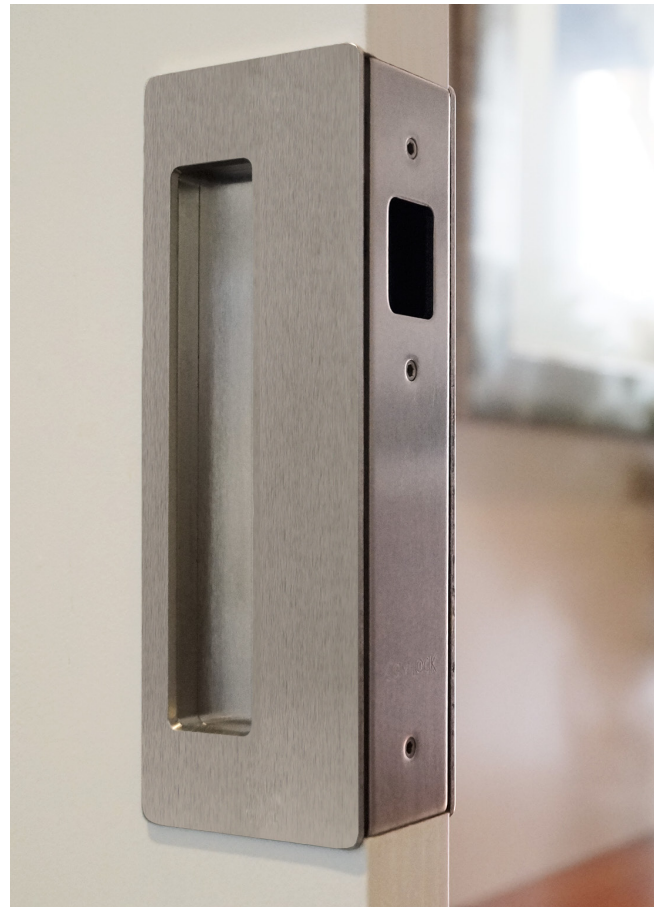
2 - CL400 Passage (non latching). Satin Chrome finish.