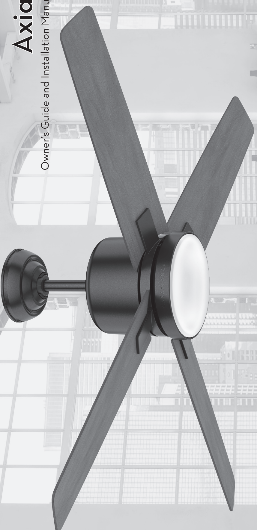
Owner's Guide and Installation Manual