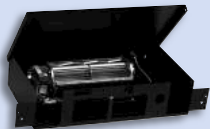
COMPLETE UNIT (Thermostat not included)