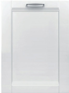
SHV78CM3N Custom Panel

PowerControl™ spray arm targets your dirtiest dishes with a deeper clean, no matter where you load them on the bottom rack.