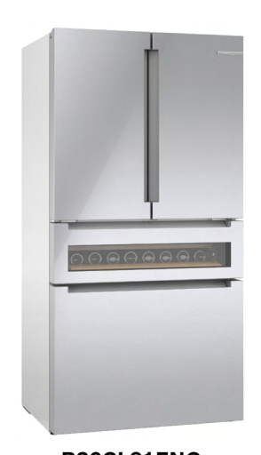
B36CL81ENG Glass over Stainless Steel w/ Recessed Handles

The industry's first Refreshment Center featuring the new glass front display drawer. Presenting a dedicated drawer with five preprogrammed settings, providing the optimal storage environment for all of your beverage needs.