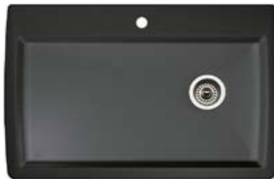
Model 440194 shown