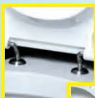
Stainless Steel Hinges