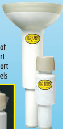
Top of Short Support Swivels