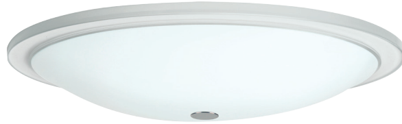
912939-HAL Manta 13

UL or ETL Listed. Suitable for Damp Locations. Interior Use Only.