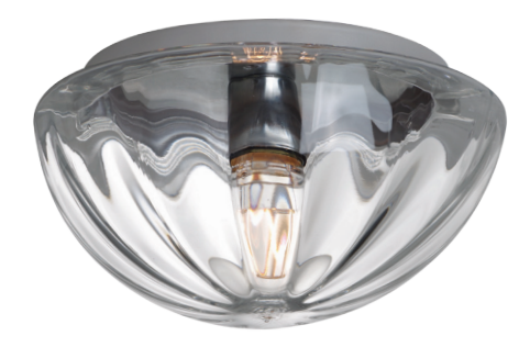
906288C Pinta 12