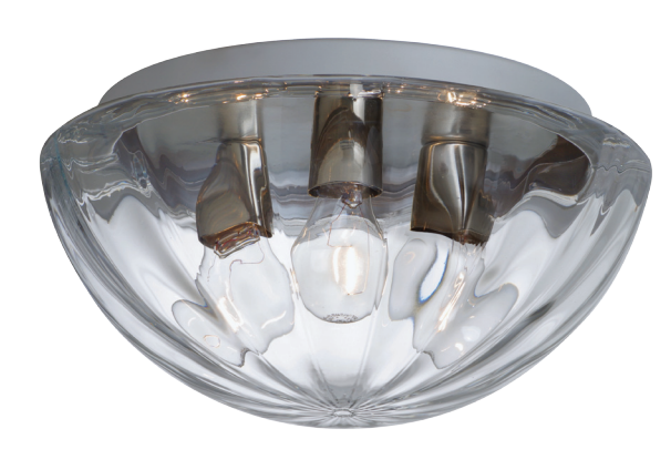
906288C Pinta 15

All dimensions provided are nominal. Allowance must be made for dimensional tolerance in handcrafted glasses.