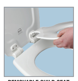
REMOVABLE CHILD SEAT