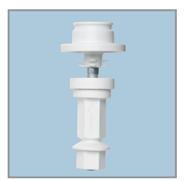
STA-TITE® SEAT FASTENING SYSTEM™