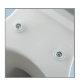
EASY REMOVAL OF SEAT FOR THOROUGH CLEANING