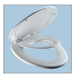
CHILD SEAT SECURES MAGNETICALLY INTO COVER WHEN NOT IN USE