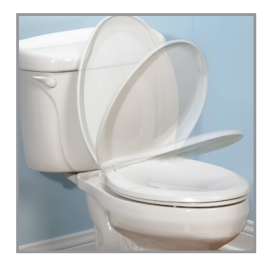
WHISPER • CLOSE® FEATURE

Fastening System: STA-TITE® Seat Fastening System™