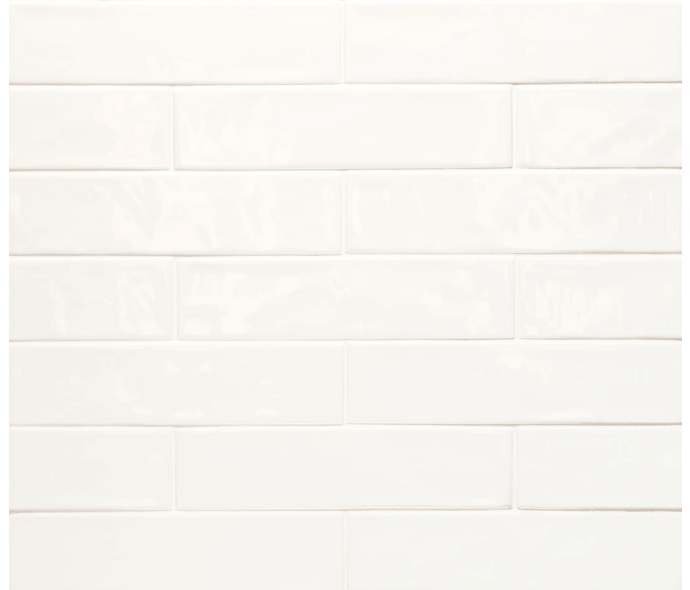
Ivory 100000804 - 2 3/4"x11" Non-rectified Wall Tile - Glossy 100000800 - 2 3/4"x11" Non-rectified Wall Tile - Matte