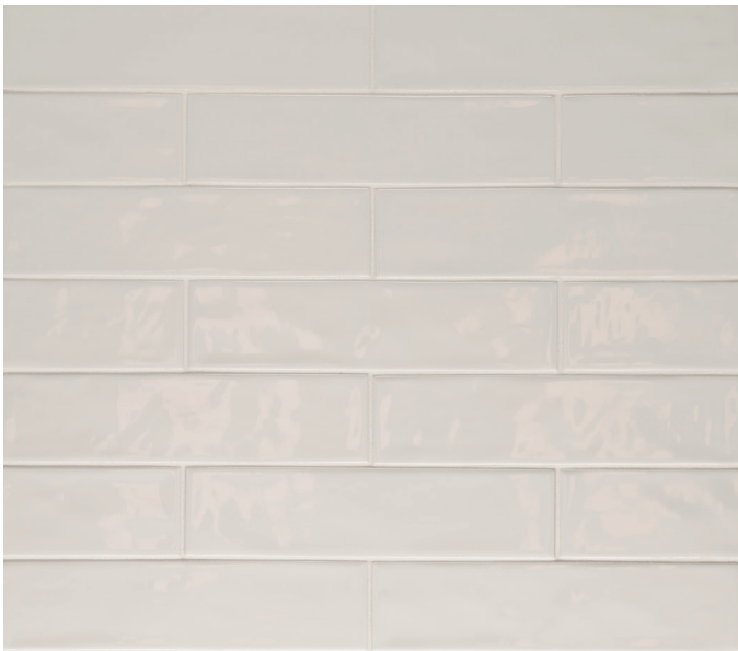
Grey 100000805 - 2 3/4"x11" Non-rectified Wall Tile - Glossy 100000801 - 2 3/4"x11" Non-rectified Wall Tile - Matte