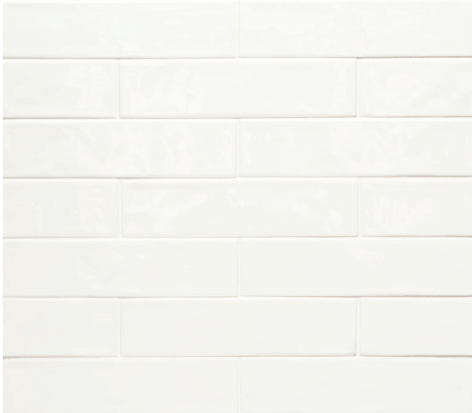
White 100000803 - 2 3/4"x11" Non-rectified Wall Tile - Glossy 100000799 - 2 3/4"x11" Non-rectified Wall Tile - Matte