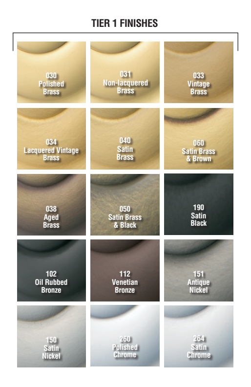
SHOWN WITH ROSE R011