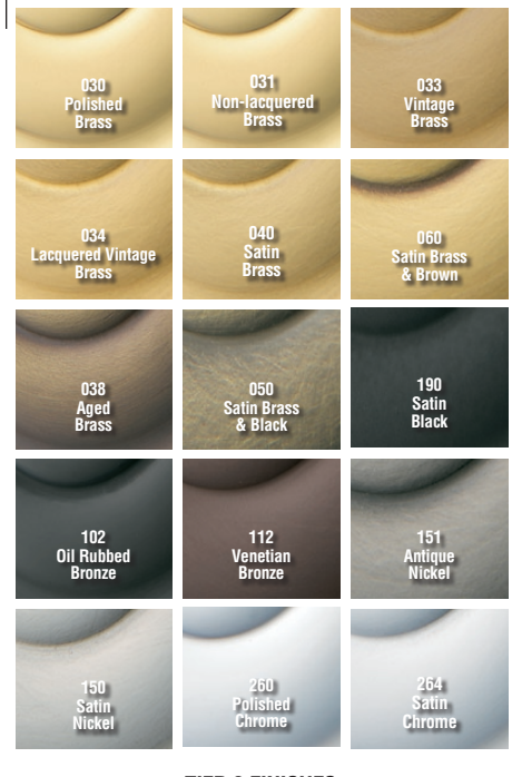
TIER 2 FINISHES