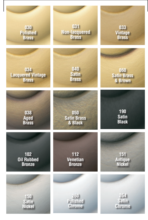
TIER 2 FINISHES