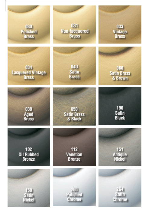
TIER 2 FINISHES