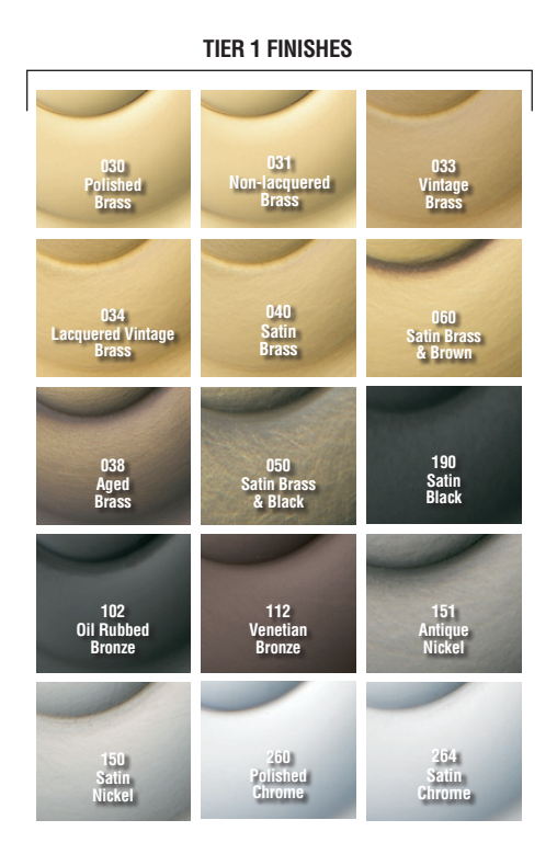
SHOWN WITH ROSE 5002