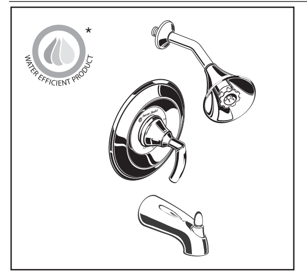
T038.508 Bath/Shower Trim Shown *WaterSense approval pending