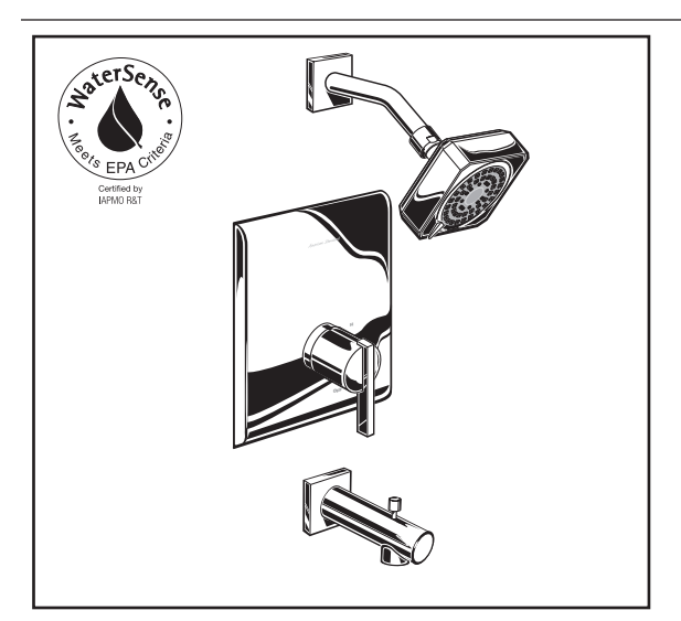
T184.508 Bath/Shower Trim Shown