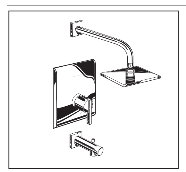
T184.502 Bath/Shower Trim Shown