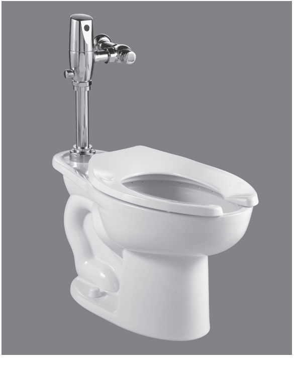
SEE REVERSE FOR ROUGHING-IN DIMENSIONS