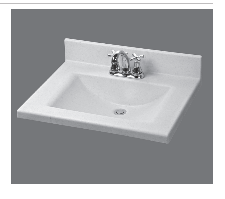
SEE REVERSE FOR PRODUCT DIMENSIONS AND SPECIFICATIONS