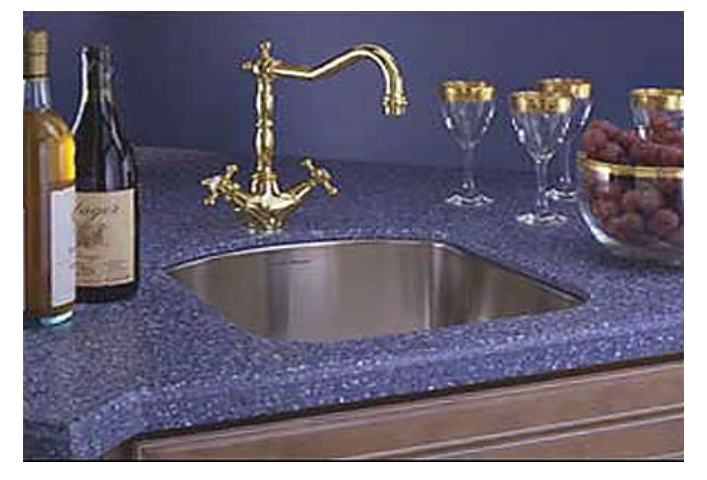
7507.000 Shown with 4233.400 Culinaire Bar Faucet (not included)

SEE REVERSE SIDE FOR ROUGHING-IN DIMENSIONS