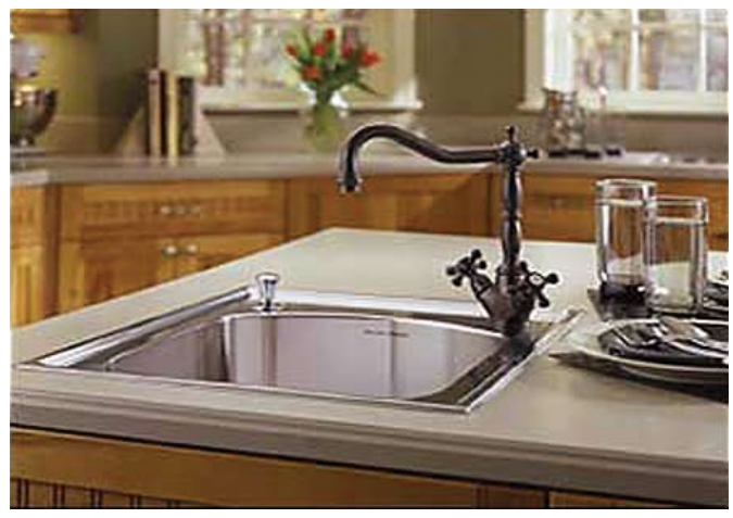
7507.103 Shown with 4233.400 Culinaire Bar Faucet (not included)