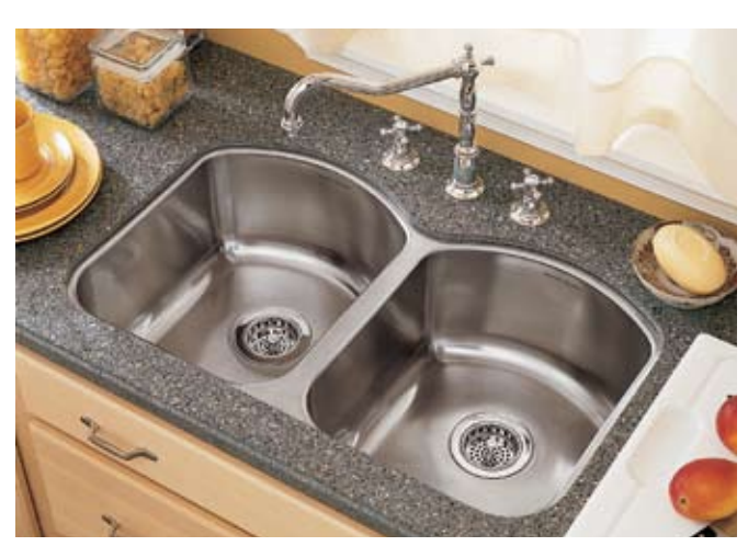
7502.000 Shown with 4233.601 Culinaire Kitchen Faucet (not included)

SEE REVERSE SIDE FOR ROUGHING-IN DIMENSIONS