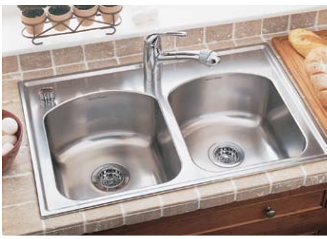
7502.103 Shown with 4137.100 Culinaire Pull-out Kitchen Faucet (not included)