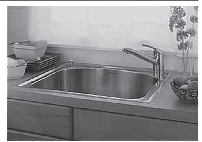
7501.103 Shown with 4137.001 Culinaire Kitchen Faucet (not included)