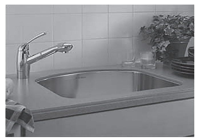
7501.000 Shown with 4137.100 Culinaire Pull-out Kitchen Faucet (not included)

SEE REVERSE SIDE FOR ROUGHING-IN DIMENSIONS