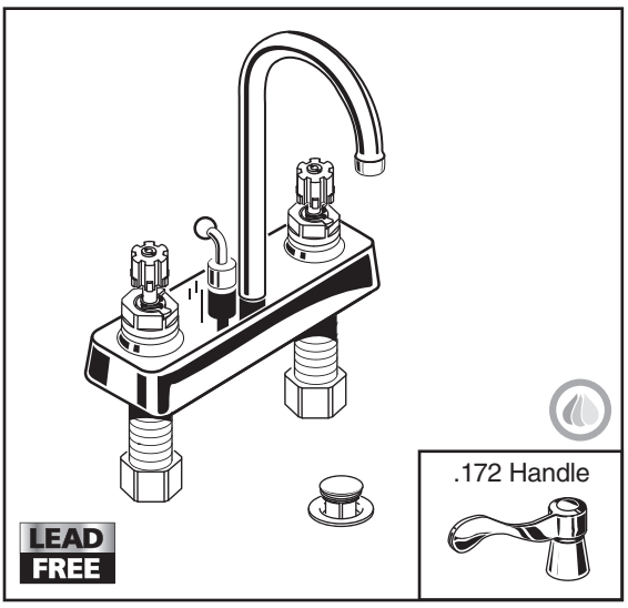
Faucet comes complete with factory installed handles. V=Vandal-Resistant, H=Standard