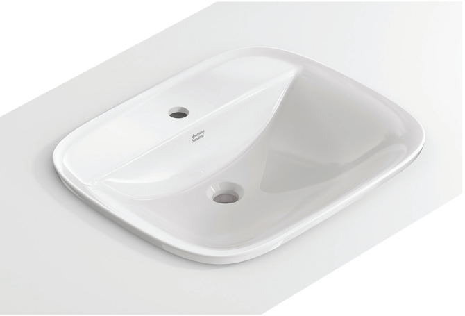
SEE REVERSE FOR ROUGHING-IN DIMENSIONS