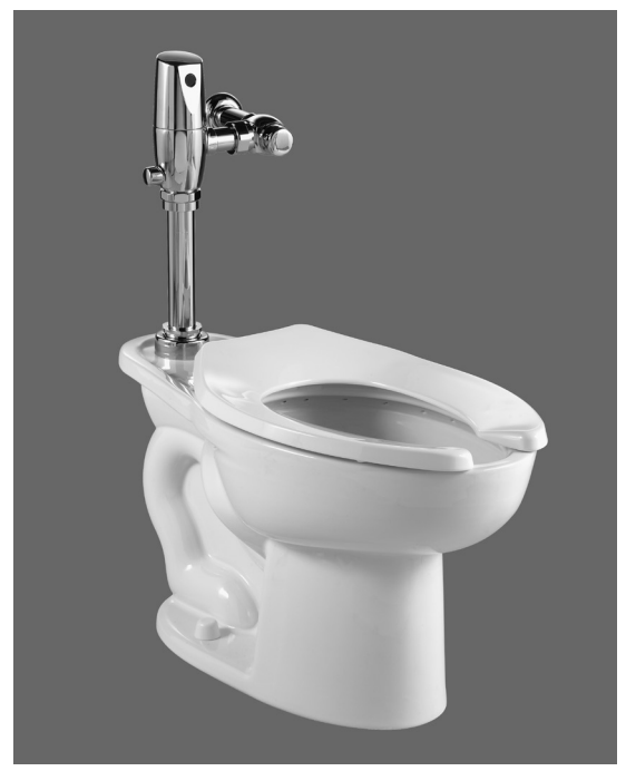
SEE REVERSE FOR ROUGHING-IN DIMENSIONS

Meets or Exceeds the Following Specifications: • ASME A112.19.2-2008 / CSA B45.1-08 for Vitreous China Fixtures