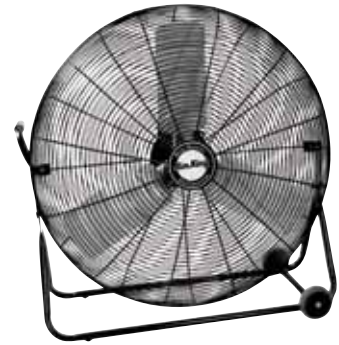
Pivoting Floor Fan 9230, 9224