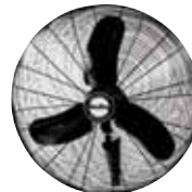
Wall Mount 9070, 9075, 9071, 9074

Secondary support cable included on Wall, Ceiling, and I-Beam Mount models.