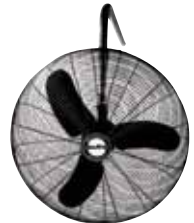
I-Beam Mount 9670, 9675, 9671, 9674