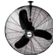
Ceiling Mount 9370, 9375, 9371, 9374